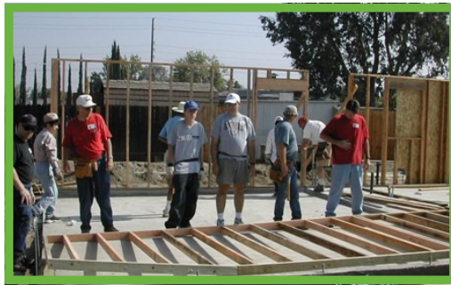
Volunteers working on a home

We are also working with the City of Grand Terrace on a two home project! The City of Grand Terrace is in the process of gifting a parcel to us for the purpose of constructing the two homes within 24 months after the transfer of title.