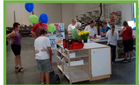
ReStore customers waiting to check out!