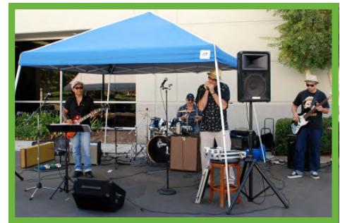
11th Street Blues Band performing at the Grand Opening.

ReStore Hours: Tuesday-Saturday 9:00am-6:00pm