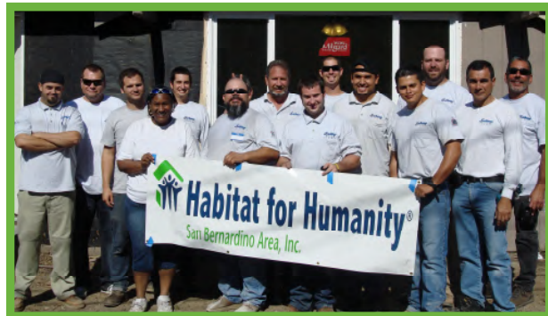
Right: St. Frances X. Cabrini Catholic Church spent the day painting the interior of the house.