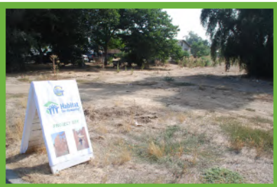
Lot for 2 future homes!